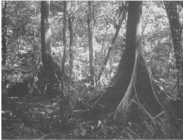
PLATE 1. Undisturbed freshwater swamp-forest in the lower catchment of the Yela River, Kosrae, Federated States of Micronesia. This frequently flooded forest type, dominated by the Micronesian endemic Terminalia carolinensis (buttressed roots), is found just landward of Kosrae's thick mangrove belt.

In response to these problems, Phillips and Gregg (2003) developed and recently introduced mixing model software (IsoSource) that is designed for situations in which n isotopes are being used and more than n + 1 sources are likely to be contributing to a mixture. IsoSource uses stable isotope data to calculate feasible ranges of source contributions by the following procedure. First, all possible combinations of source proportions that sum to 100% are calculated in user-specified increments (usually 1%). Second, the predicted isotope values of each mixture are computed using linear mixing model equations that preserve mass balance (Phillips 2001). Isotope values of computed mixtures are then compared with the observed isotope values; the range of combinations that match within a user-specified tolerance value (e.g., 0.1‰) is then described.